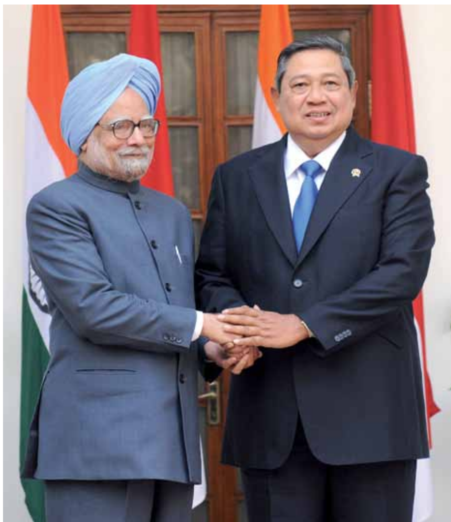
Prime Minister, Dr. Manmohan Singh meeting the President of the Republic of Indonesia, Dr. H. Susilo Bambang Yudhoyono, in New Delhi on January 25, 2011.

The Indonesian President graced the Republic Parade on 26 January as the Chief Guest. It may be recalled that the honour of being India's first Chief Guest of its first Republic