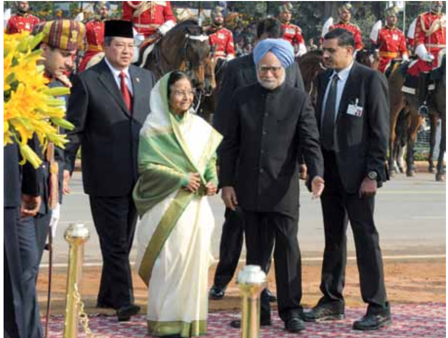
The Chief Guest President of the Republic of Indonesia, Dr. H. Susilo Bambang Yudhoyono and the President, Smt. Pratibha Devisingh Patil being received by the Prime Minister, Dr. Manmohan Singh on their arrival at the 62nd Republic day celebrations, in New Delhi on 26 January 2011.

A recent example in hi-tech cooperation with India was the launch of Indonesian micro satellite Lapan-Tubsat, used for environmental monitoring in 2007 from India's Sriharikota space centre. A Cultural Agreement between the two Governments under which Cultural Exchange Programmes (CEP) take place, has been in place ever since 1955. The