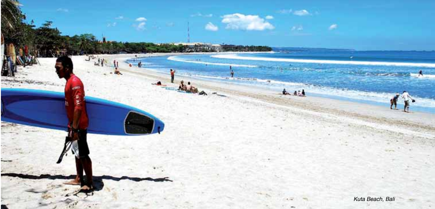
Kuta Beach, Bali

Minister Jero Wacik urged the tourist industry, especially hotels to display these artefacts prominently as essential part of their décor with the explanation that these are UNESCO recognised World Heritage.