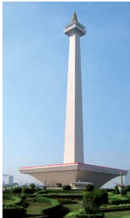
The National Monument (Monas), Jakarta

range from exotic Asian cuisines to American fast food to Fine French dining; it all boils down to one city that is Jakarta. The best time to visit Jakarta is during the dry season ie May to September.