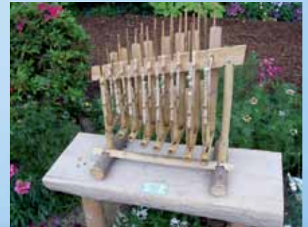
Angklung with eight pitches

In the field of Culture, in 2010 Indonesia's Angklung (bamboo musical instrument) was included in UNESCO Representative List of Intangible Cultural Heritage of Humanity. This follows UNESCO's recognition of Indonesia's Wayang, Keris and Batik as World Cultural Heritage.