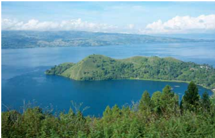
Lake Toba, Sumatra

in Sumatra its largest lake, with an area of 1,145 sq km.