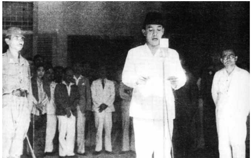
Sukarno, accompanied by Mohammad Hatta, declaring the independence of Indonesia on 17 August 1945, at Pegangsaan Timur 56 (now Jalan Proklamasi), Jakarta.

Islam: Although Muslim traders first travelled through South East Asia early in the Islamic era, the earliest evidence of Islamised populations in Indonesia dates to the 13th century in northern Sumatra. Other Indonesian areas gradually adopted