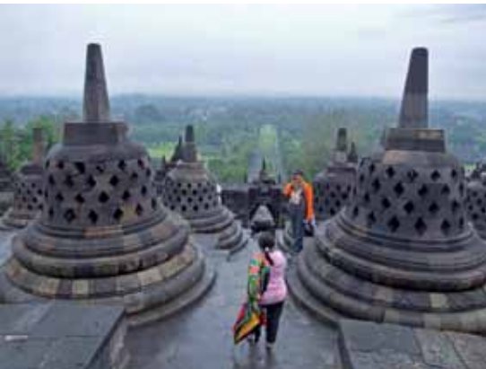
Borobudur temple, Java

Java - This is an island in Indonesia that houses Indonesia's most famous cultural icon, the colossal, multi-tiered Borobudur temple which is the world's biggest Buddhist monument. The temple was built during the reign of Syailendra dynasty in the 9th century which clearly shows traces of influence of Indian architecture. This monument is both a place for Buddhist pilgrimage and a shrine to the Lord Buddha. The details and illustrations carved on the walls of the temple show Lord Buddha's road to enlightenment. Java is also famous for Dieng plateau and the Suku temple. Traditional dance dramas ( Wayang Orang ) or shadow puppets ( Wayang Kulit ) should not be missed at any cost. The Grand Mosque, located in Demak is a picturesque blend of Hindu and Islamic architecture, still honoured and worshipped by Javanese pilgrims. A whole stretch of mountain ranges can be seen across central Java offering a panoramic view.