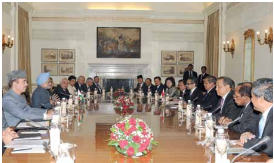
Prime Minister, Dr. Manmohan Singh with the President of the Republic of Indonesia, Dr. H. Susilo Bambang Yudhoyono, at the delegation level talks, in New Delhi on 25 January 2011.

Tourism, and Youth affairs and Sports. The two leaders also acknowledged cooperation in Education, Media, Air services, Energy resources including oil, gas, coal, and renewable energy, prevention of smuggling, prevention of illegal trade in narcotics, disaster management, cooperation in the area of small and medium enterprises, meteorology, climatology and geophysics including climate change, health, marine and fisheries".