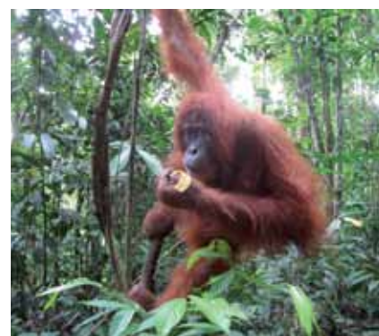
Gunung Leuser National Park, Sumatra

There are 50 national parks in Indonesia, of which six are listed as World Heritage Sites. Gunung Leuser National Park located in Sumatra is the largest national park, followed by Kerinci Seblat