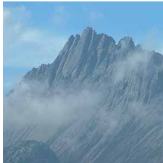
Puncak Jaya, Papua

Lying along the equator, Indonesia has a tropical climate, with two distinct monsoonal wet and dry seasons. Average annual rainfall in the lowlands varies from 1,780-3,175 millimetres (70-125 in), and up to 6,100 millimetres (240 in) in mountainous regions. Mountainous areas—particularly in the west coast of Sumatra, West Java, Kalimantan, Sulawesi, and Papua—receive the highest rainfall. Humidity is generally high, averaging