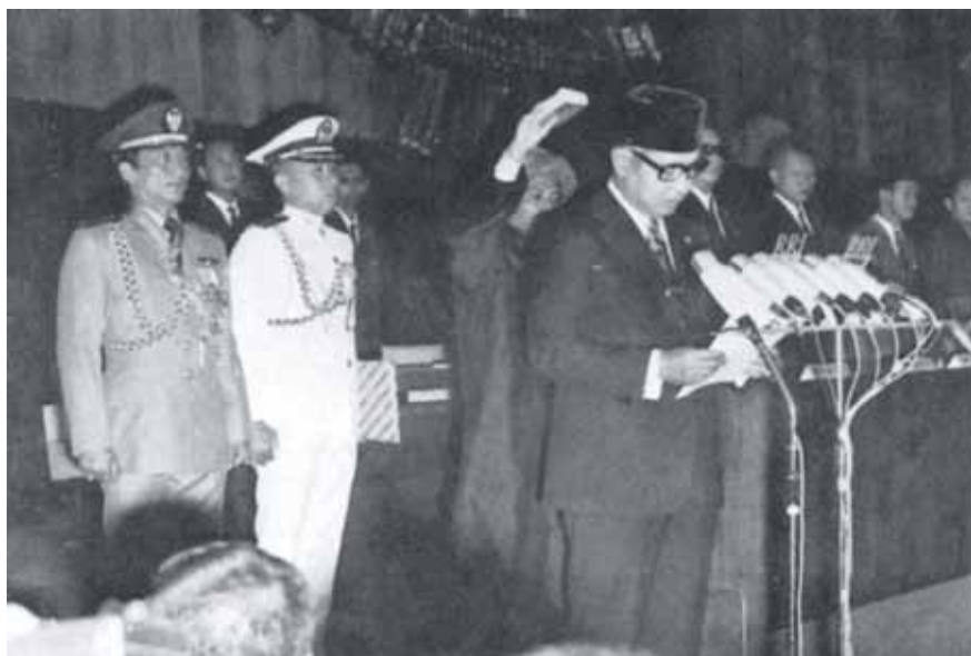
Suharto is appointed President of Indonesia at a ceremony, March 1968.

Indonesia is signatory to the ASEAN Free Trade Area agreement, the Cairns Group, and the WTO, and has historically been a member of OPEC, although it withdrew in 2008 after ceasing to be a net exporter of oil.