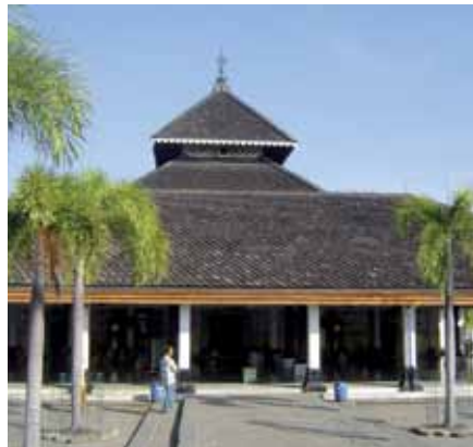
The Grand Mosque, Demak

Lombok - This is an island with stunning beaches and varied landscape. Surprisingly the best time to visit the island is during the rainy season (October-April) when humidity decreases. The dry